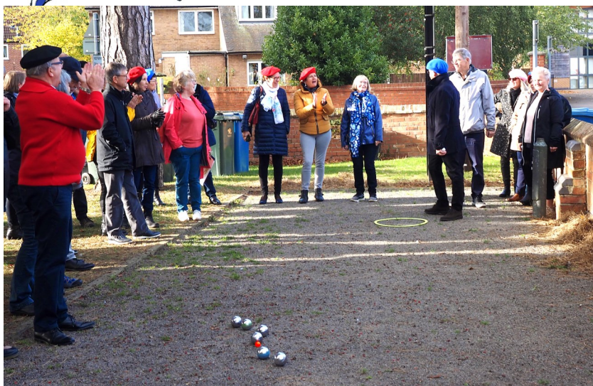
An Autumn Encounter

The Radcliffe on Trent Twinning Association hosted an action-packed 3 days that led to yet another highly successful exchange visit with our partner town of Bussy St. Georges. Old friendships were renewed and new ones developed as some 30 visitors ranging from 5 to 55+ enjoyed the many and varied delights of Radcliffe and beyond. These included a day trip to Leicester to visit the Richard III exhibition and the Cathedral. This was followed by a less sober trip to the Belvoir micro-brewery where hosts and visitors savoured and purchased some of the excellent beers on offer.