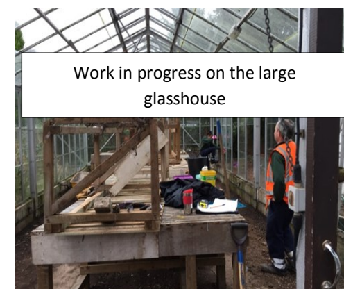
Work in progress on the large glasshouse

Spring has sprung and new life has been breathed into the glasshouses in Rockley Park. Over the winter, this area has been a hive of activity as work has been underway to restore the site to a productive environment for the spring. The three glasshouses have been cleaned and re-glazed and new cold frames and storage sheds have been installed ready for the growing to begin.