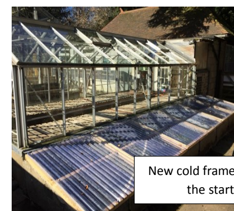
New cold frames and storage sheds ready for the start of the growing season